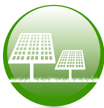
Uratom will set up solar farm in a remote location

Uratom Solar can supply solar power to you from one of our solar farms in Gujarat. There is zero upfront investment and the power supplied will be cheaper than the grid electricity under a long-term Power Purchase Agreement.