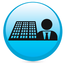
Client will own the system