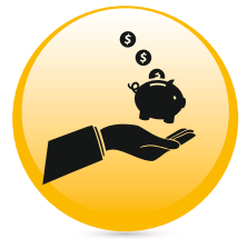
Customer Saving On Monthly energy Bills