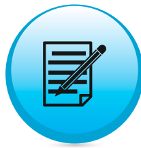
Sign a long term O&M Contract (optional)