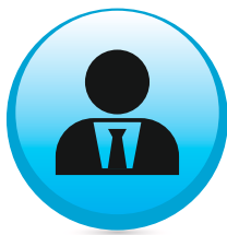
Client pays for EPC cost

Uratom Solar will install the solar power plant, and you take the asset ownership. Post installation, our expert engineers will ensure your solar energy operations run efficiently under an operation & maintenance agreement.