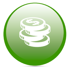
Uratom solar bills you for electricity supplied