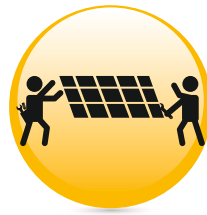
25 years of Operations & maintenance