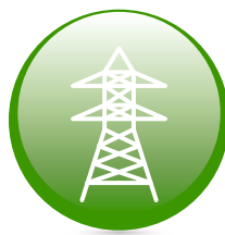
Uratom will wheel power to your facility using grid infrastructure